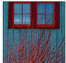
Blue Barn by Jeanette Sheehy