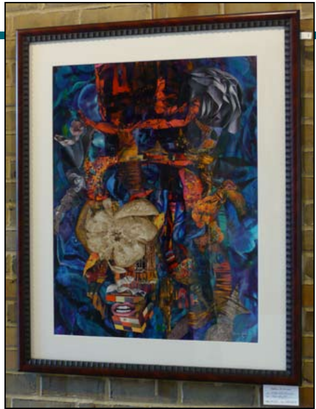
The Gift , mixed media by Joan Krathaus

Sign up at a monthly meeting or contact Bev Braun at 489-0601.