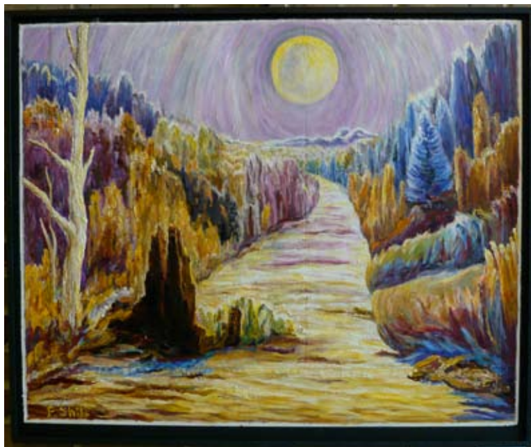
Let Do the Evening Stroll