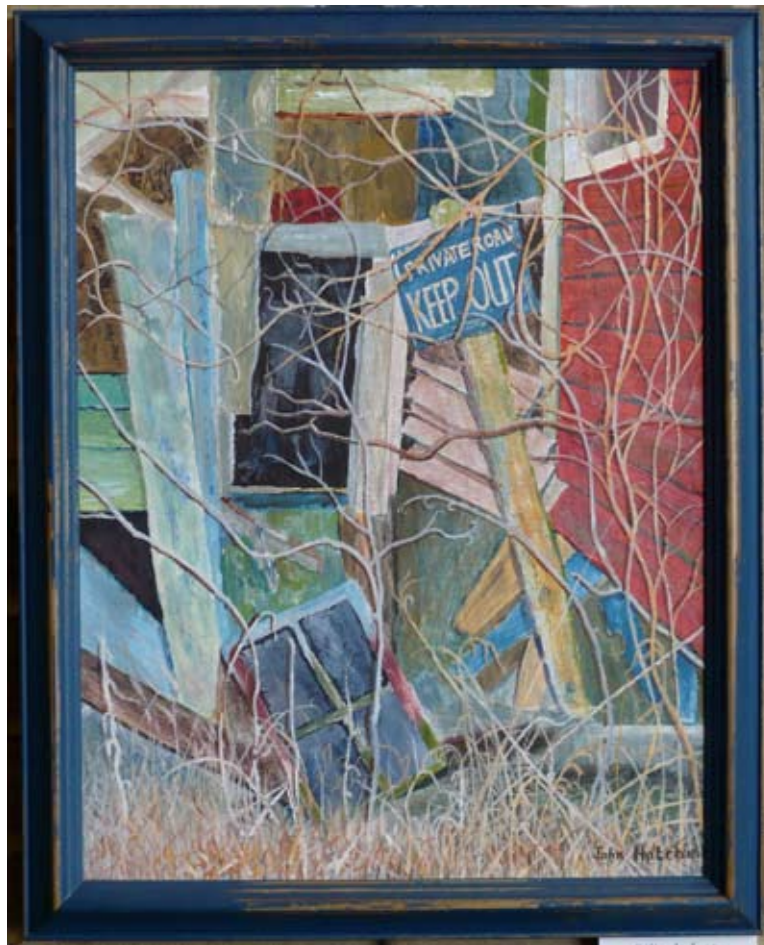
Window to the Past