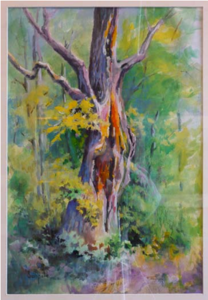
Beloved Oak Marjorie Scilipote Watercolor