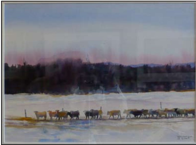
New Year's Day 2009